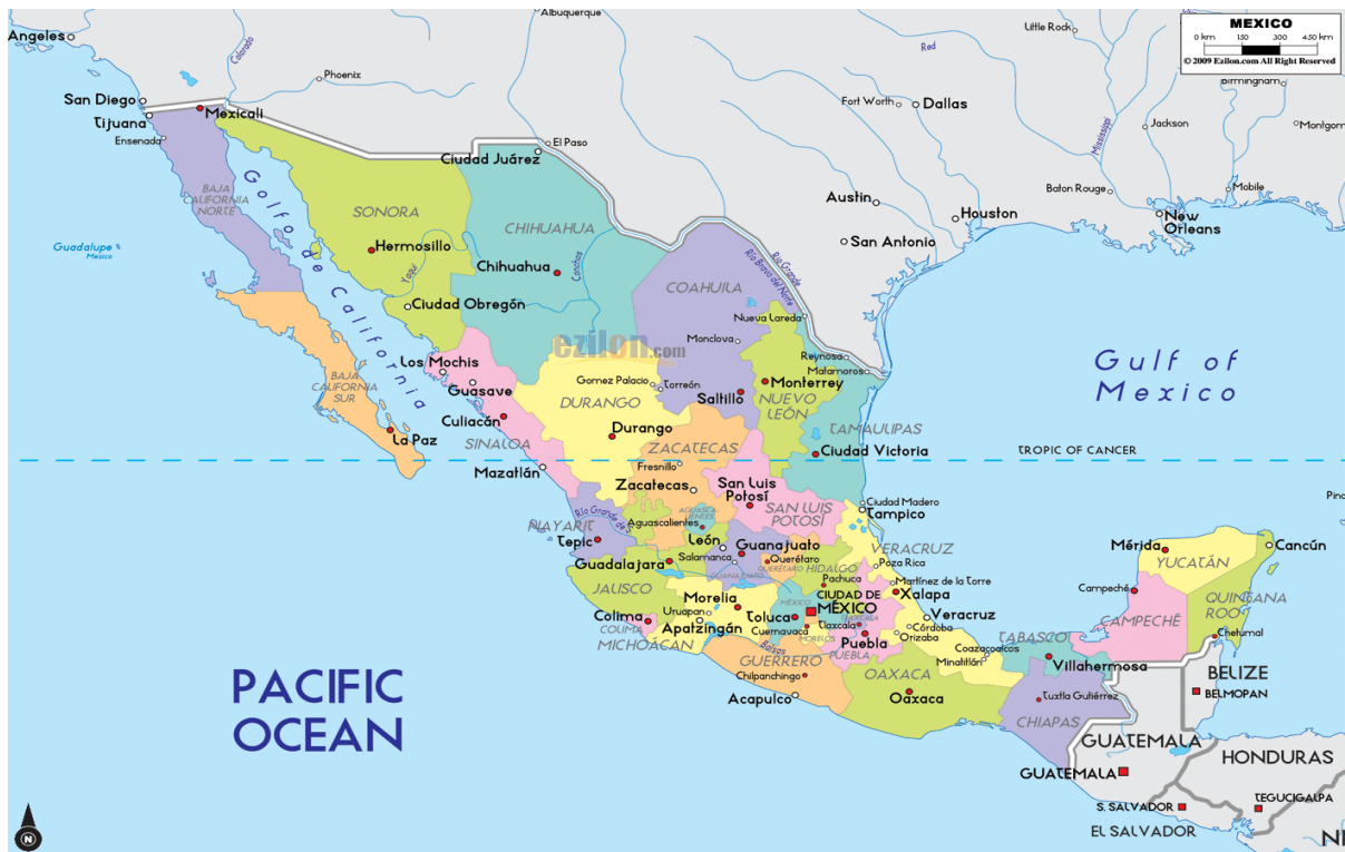
Figure 1. Mexico by state, for reference.