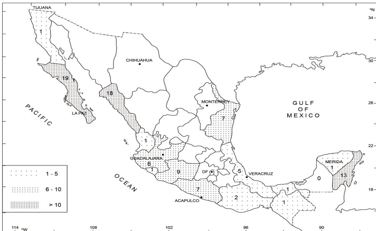
Figure 2. Landfalling hurricanes (all categories) by state, 1951-2000.